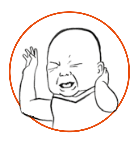
head turning red