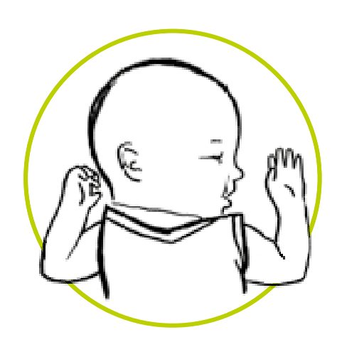
turning their head, searching